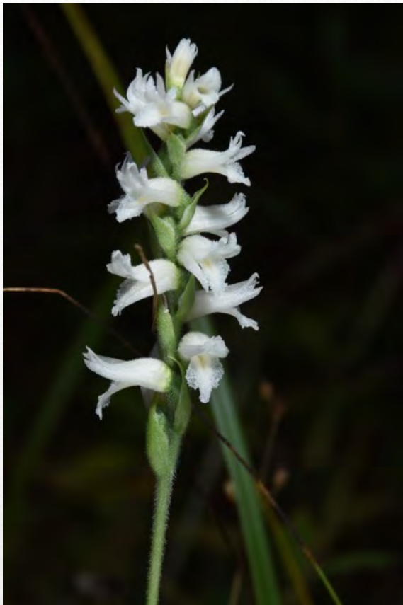
Natural botanical gardens