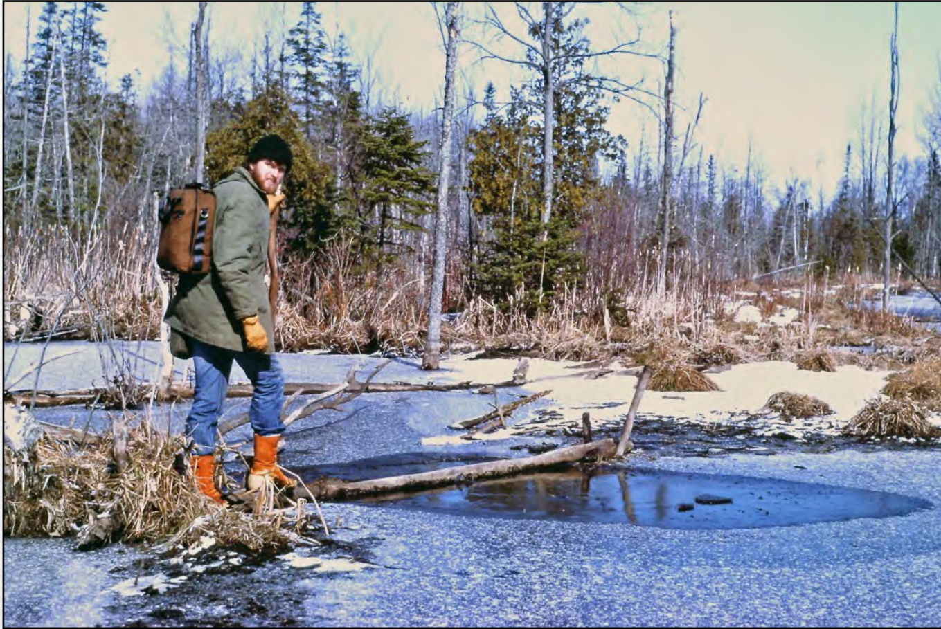
Remote settings for wildlife photography